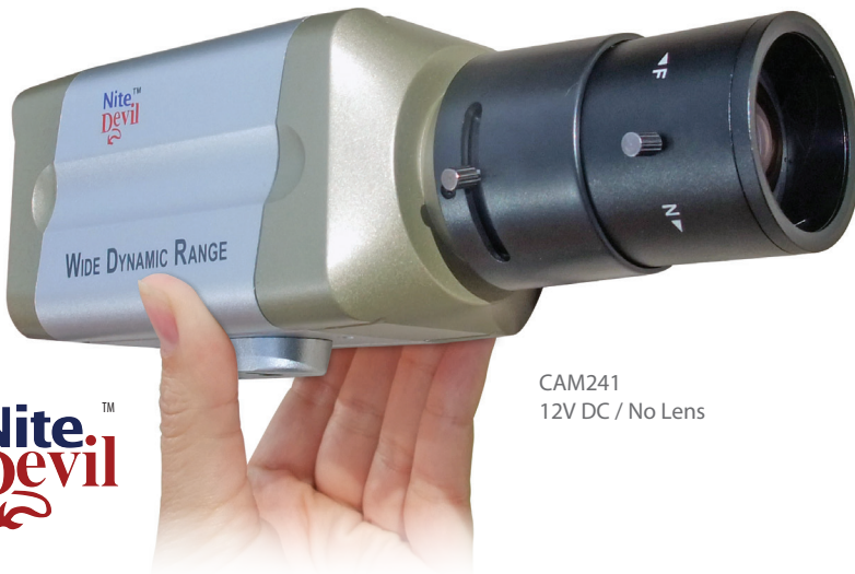
CAM241 12V DC / No Lens