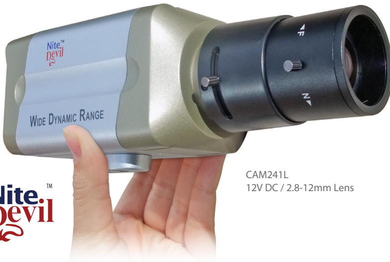
CAM241L 12V DC / 2.8-12mm Lens