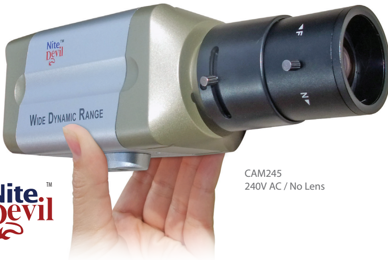
CAM245 240V AC / No Lens