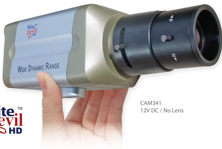
CAM341 12V DC / No Lens