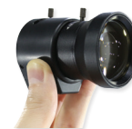
Megapixel Lens 5-50mm MPL350

Visit the user friendly site: www.nitedevil.com