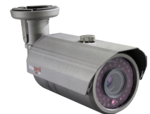
Graphite Grey CAM380G

Visit the user friendly site: www.nitedevil.com