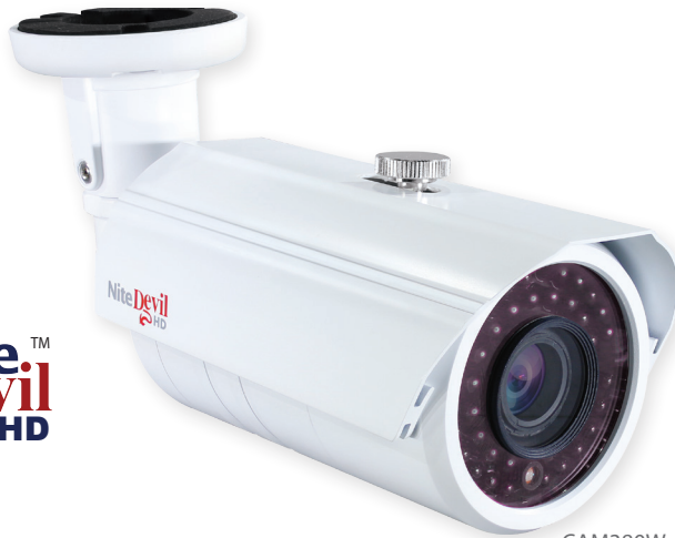
CAM380W Polar White